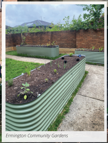
Ermington Community Gardens