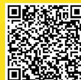
ONLINE FEEDBACK FORM

Your voice matters to us. For more information or for assistance, please speak to our staff.