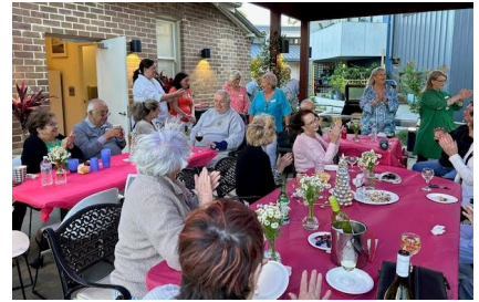
Christmas Lunch at Burraneer

A huge shoutout and an immense thank you to Aura Group NSW Pty Ltd for their incredible generosity! Their donation of 500 Christmas Hampers for the tenants of Amélie and St Vincent De Paul Housing was gratefully received. Aura Group's commitment to making a positive impact in our community is inspiring, and we were honoured to be part of this wonderful initiative!