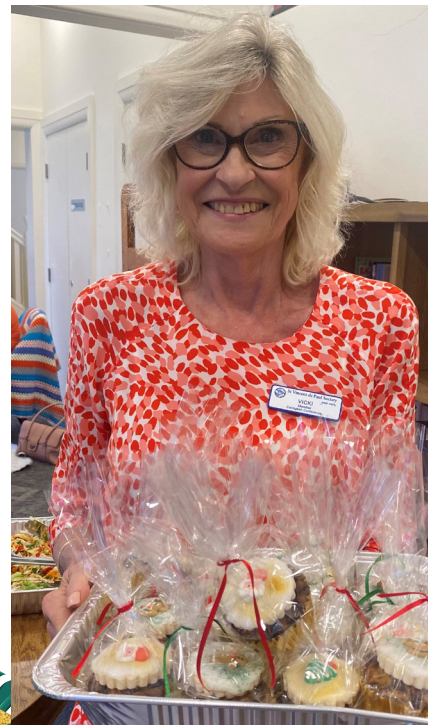
Sharing homemade Christmas cakes