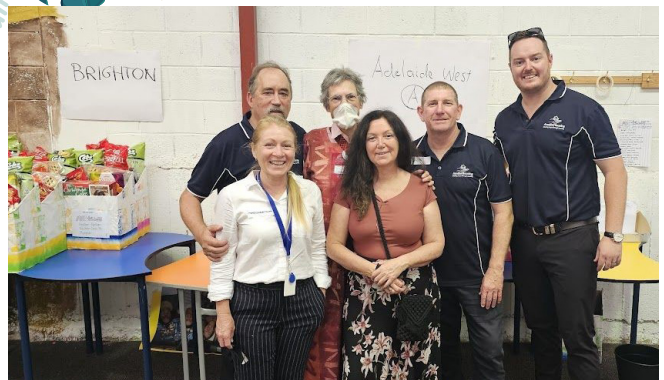
SA team members at the The Adelaide Day Centre for Homeless Persons