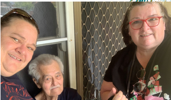
Delivering hampers, bringing hope and joy