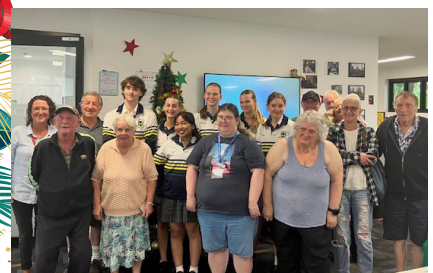
Celebrating Christmas at Albury